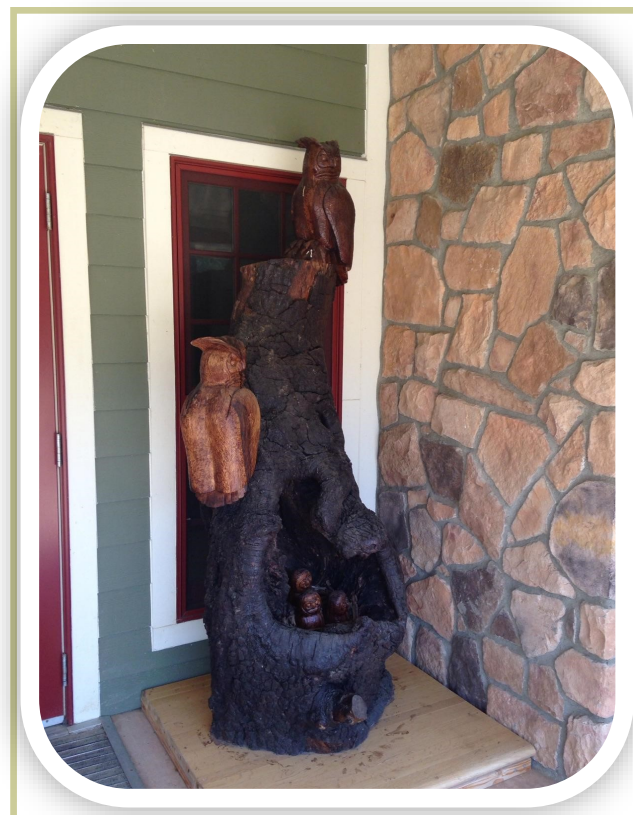
New Statute at Visitors Center donated by the City of Poway

Young skunks are able to spray by the time they are seven weeks old, and they won't hesitate to spray. Also, they can and will bite. Be especially wary of “friendly” skunks, since one of the characteristics of rabies in wildlife is a loss of fear of humans.