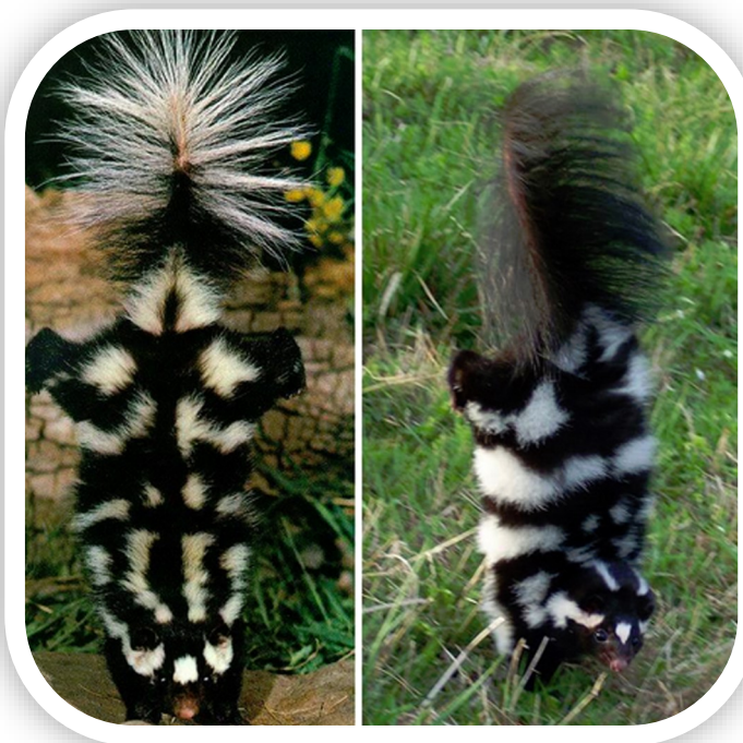
Before they spray, Spotted Skunks do a handstand to warn off predators!

major predators of the Western Spotted Skunk are humans, dogs, cats, bobcats, foxes, coyotes and owls.