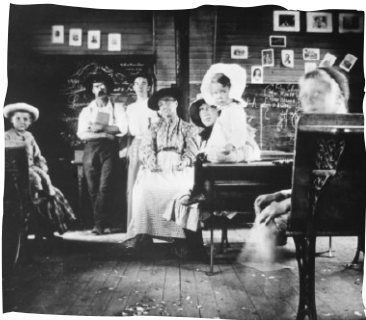
Stowe School classroom, circa 1900.

In 1997, the California Department of Fish and Game, US Fish and Wildlife Service, and the County of San Diego approved the Subarea Plan of the Multiple Species Conservation Program (MSCP). The biological goal of the MSCP is to maintain ecosystem functions